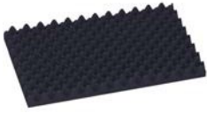
Vaulted Foam Lid Insert for Systainer 3 M

A rectangular contoured foam that is universal for Systainer 3 , and optimally protects sensitive or small objects, ensuring they are sealed tight and do not fall out.