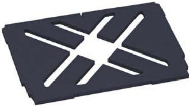
Base foam with cross cut-out

Contains different base crosses that allow for a flat surface.