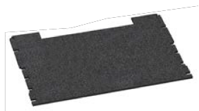
EPP Foam Lid Insert for Systainer 3 M

Seals off the bottom inserts to keep sensitive objects sorted and protected effectively.