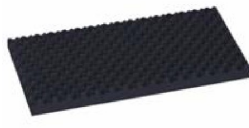
Vaulted Foam Lid Insert for Systainer 3 L