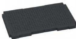
Pick and Pluck Foam Rigid for Systainer 3 L