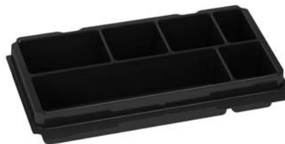
Compatible with: Systainer 3 L 137