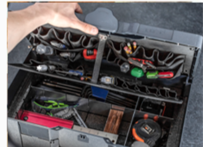
Quick & Easy