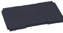
Base foam soft for Systainer 3 L