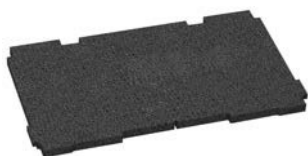
EPP Foam Base Insert Compatible with Systainer 3 L

Similar to Base foam as it is cross cut-out which enables enclosed products to lay on a flat surface.