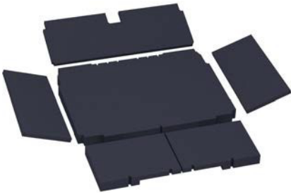
Compatible with: Systainer 3 M 187

This insert allows for all around protection, including that of the inside walls, and offers different heights and shapes.