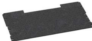
EPP Foam Lid Insert for Systainer 3 L