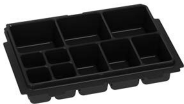
Compatible with: Systainer 3 M 112

The advantage is that it facilitates small parts storage with excellent precision and is more resistant to sharp objects in comparison to foam. Comes in two variants: with 10 compartments (compatible with Systainer 3 M 112) and with 6 compartments (compatible with Systainer 3 L 137).