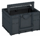
Systainer 3 M 9.06"